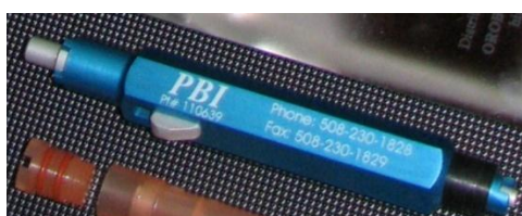
Figure 2: The Shredder-Tube Cap Tool.

After evenly distributing the small tissue pieces on the Lysis Disk at the narrow Ram side of the Shredder-Tube, a serrated Shredder-Ram is inserted with a twisting motion to press the sample between the serrated surface and the Lysis Disk by using the Shredder-Tube Cap Tool ( Figure 2 ).