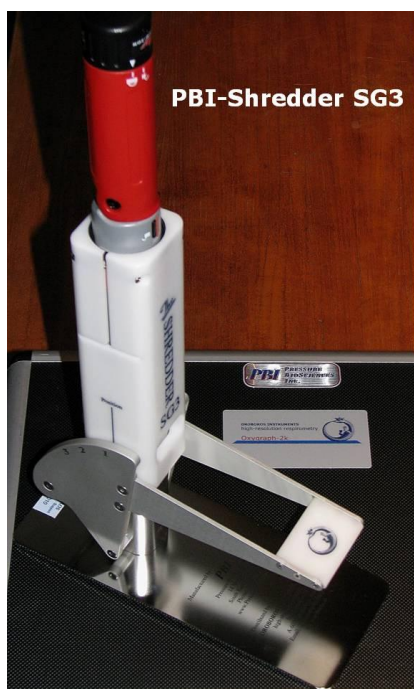
Figure 1: The PBI-Shredder SG3 with handle (red) and torque driver (white) assembled with the force setting lever (metal) ready for application.

Application of high-resolution respirometry with gently prepared tissue homogenates offers a versatile tool to study mitochondrial function in small amounts of tissues. The PBI-Shredder SG3 (Figure 1) is a low shear mechanical homogenization system, designed to apply reproducible force to the tissue with three positions of the force setting lever. This yields standardized, rapid and safe disruption of cells with preservation of intact, functional mitochondria. The laboratory-specific or even operator-specific protocols for tissue homogenization are thus standardized, providing reproducible and consistent results for quantitative and inter-laboratory comparison. The easy handling enables especially beginners to obtain reliable results.