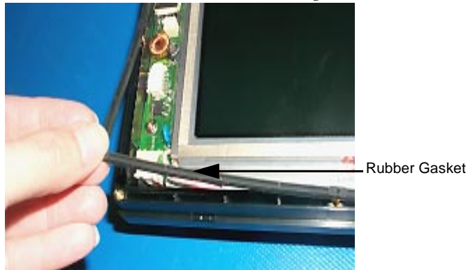
Figure 3 Rubber Gasket

Important The rubber gasket that fits along the rim of the unit seals out moisture. Push it back into place if it comes out when you remove the touchscreen. See Figure 3 below.