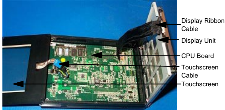
Figure 4 PowerStation Disassembled