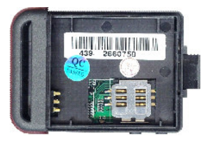
Slide clip this way ←