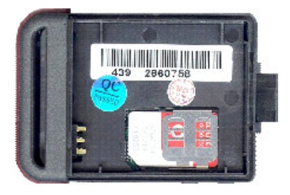
Insert SIM card and slide clip >