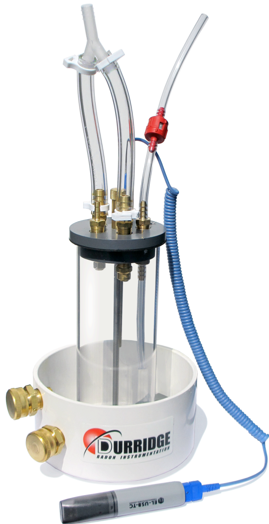
Fig. 1 RAD AQUA with Temperature Probe

The air return is sent, via the check valve, to the internal tubing that terminates halfway down the cylinder. The actual length of that internal tubing is not critical. If it is very short air would be able to short-circuit the exchanger without passing through the spray. If it were too long it may terminate beneath the internal water surface and may lose air through the water outlet. It should be about halfway down the cylinder.