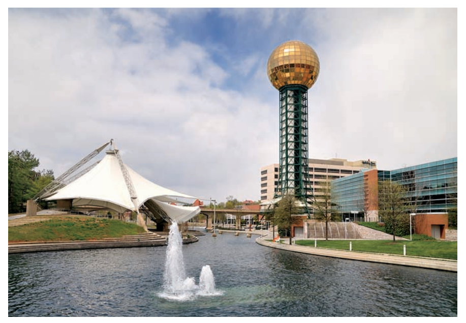
FIG 2 - 1982 World's Fair site in 2010. Shown are the Sunsphere and Ampitheater. Knoxville, TN USA. Nikon D300 and a Sigma 18-50mm f/2.8 EX HSM lens. F8 at 1/125s, 200 ISO, Matrix meter.

All through the book I offer my own personal recommendations as to settings and how to use them. Look for the paragraph(s) starting with My Recommendation at the end of most chapter sections. These are suggestions based upon my own personal shooting style and experience with Nikon cameras. You may eventually decide to configure things in a different way, according to your own needs and style. However, these recommendations are good starting points while you become familiar with the camera.