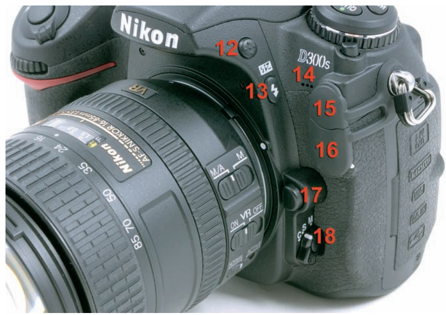
FIG 2 – Left front of camera (12–18)