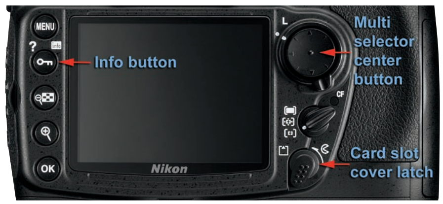
FIG 6 – D300 control differences

The Nikon D300S and D300 are physically different in a few places. The Info button, Memory card slot cover, and Multi selector center button work differently or have different locations. Below is a picture of the back of a D300, with the differences noted. The Multi Selector on the D300 does not have the newer style Multi selector center button (see FIG 5, number 39). However, it works the same way—by pressing on the middle of the Multi Selector with your thumb. In FIG 6 are the locations of the Info button, Multi selector center button, and Card slot cover latch. Use the latch to open the Memory card slot cover.