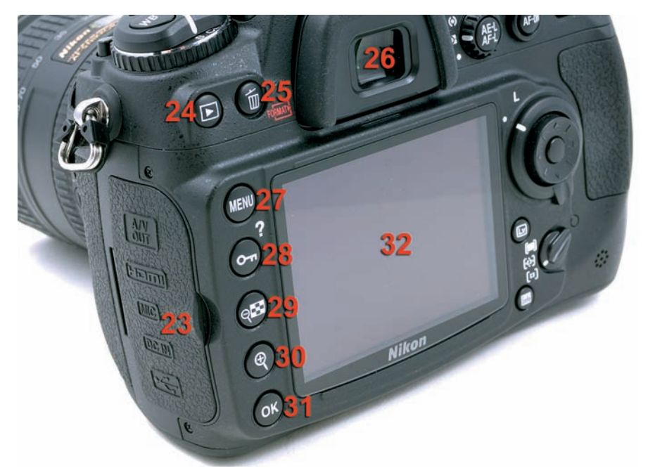
FIG 4 – Left back of camera (23–32)