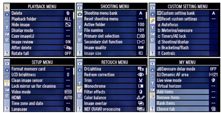
FIG 1 - Six primary camera menus (optional Recent Settings menu not shown)

The six menus that are found under the D300(S) menu system are, in order, as follows (see FIG 1):