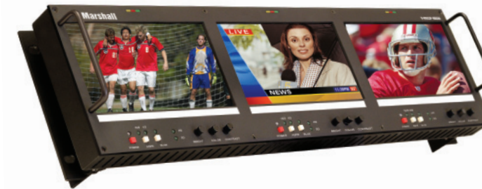
V-R653P-HDSOI Users Guide

1910 East Maple Ave. El Segundo, CA 90245 Tel.: 800-800-6608 • Fax: 310-333-0688 www.LCDRacks.com Email: sales@lcdracks.com