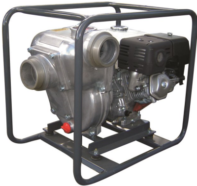
Transfer pumps .. Move water fast