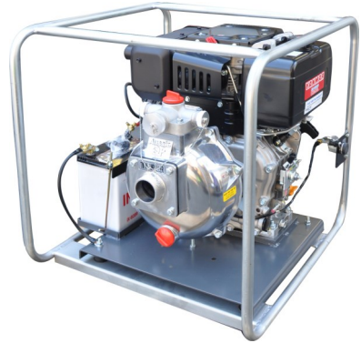
Twin Impellers ..Extra performance