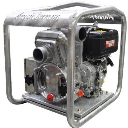
Trash pumps .. Dirty water solutions