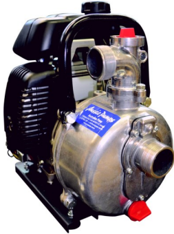
Ultralites .. Portable pumps