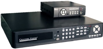
DVR-43G, DVR-83G, DVR-163G