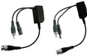
B-300 Video Balun Kit