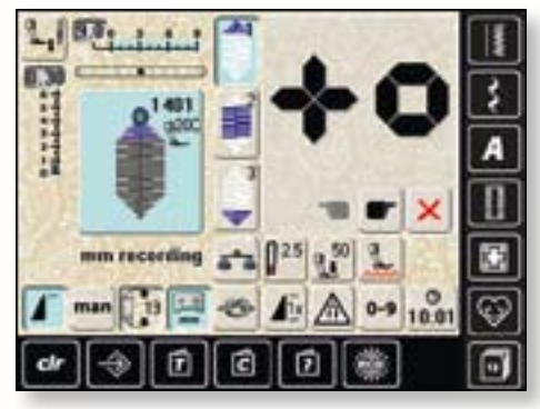
Tapering: Team your creativity with new techniques. With tapering, the beginning and end of the stitch patterns taper to a point. Choose from four different basic stitch angles, for even more creativity.