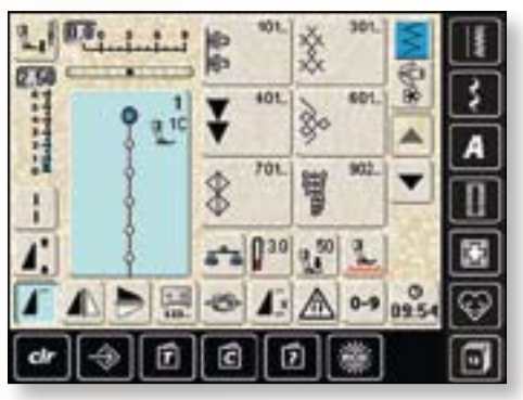
Stitch Selection: With 350 stitch patterns and sewing stitches plus characters, a total of over 770 imaginative stitches – over 100 of which were developed exclusively for the BERNINA 8 Series – are available to you, to combine however you like.