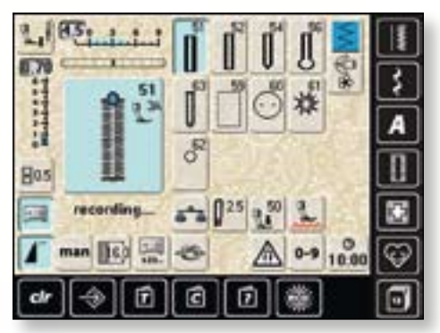
Customised Buttonholes: As well as on-screen setting of the buttonhole length, the slit width can also be changed – from 0.1 to 2 mm – to accommodate any type of button you may be using. The buttonholes can then be perfectly repeated as often as you wish.