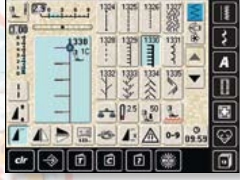
Appliqué & Patchwork: A wealth of stitch designs including stippling and feathering, specially designed for appliqué and patchwork projects, are available for you to choose from.