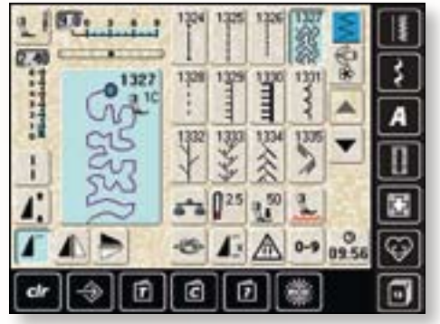
Quilting: The exclusive BERNINA BSR system makes free-motion quilting much easier with beautiful even stitches at whatever speed you work. Built-in Dual Feed allows for smooth feeding of all the layers of your quilt. The clearance between presser foot and stitch plate is adjustable up to 7 mm, letting you easily reposition thicker layers with the presser foot in hover position.