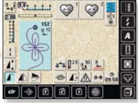
Memory options: You can customise stitch patterns by changing stitch width/length or tension and store these changes in either of 2 personal programs, ready to use again when needed. The stitch memory function lets you combine and record up to 50 stitch patterns, letters and numbers in up to 30 separate drawers.