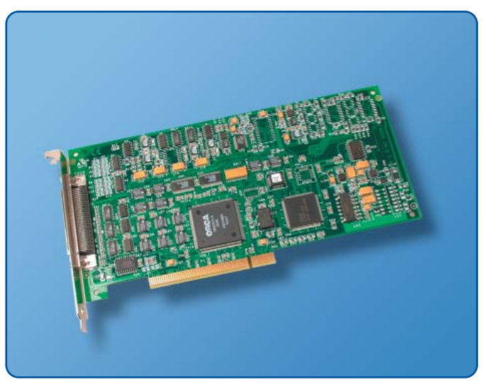
Figure 1. The DT300 Series is a family of low-cost, multifunction PCI bus-mastering boards.

■ Supported by Measure Foundry™, test and measurement application builder software that lets you easily create complex measurement applications