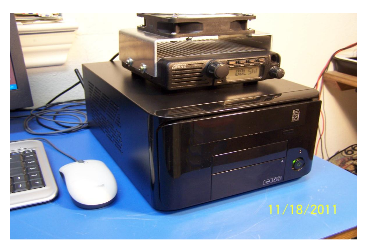
The complete Hotspot computer and radio.

Finally, I have read suggestions that the DutchStar software is due for updates because it does not send synch information as often as the ICOM repeater software does. If true, this would account for the added time it takes for radios to restore synchronization after it's lost.