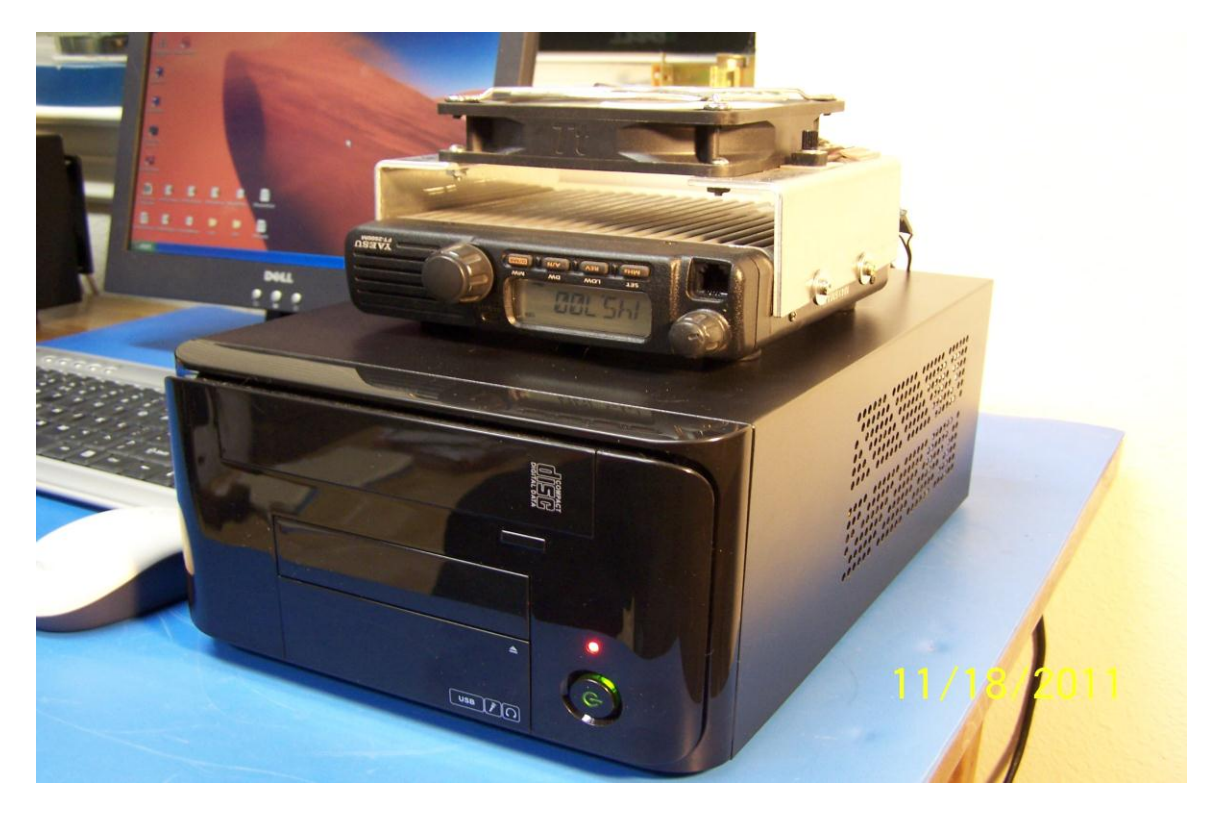
The KV5V Hotspot computer and radio.

The Hotspot software can also connect to Reflectors, using the Dplus Reflector Server and software which has been added to most repeater Gateways.