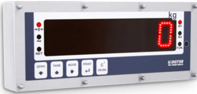
DGT60 indicator / repeater.