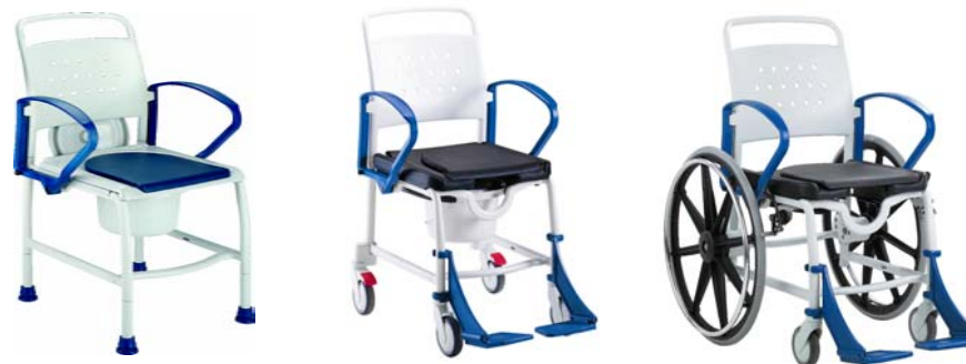
(Shown is a selection of chair types)

Advisory! Always use the equipment's or component's User Instructions when carrying out maintenance and follow its instructions for maintenance and safety.