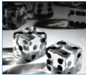
13,000:1 Contrast Ratio