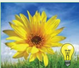
Bright scene ~100% Power consumption