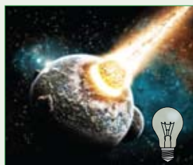
Dark scene ~ 30% Power consumption