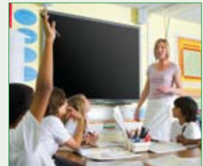
Eco AV mute on 30% Power consumption