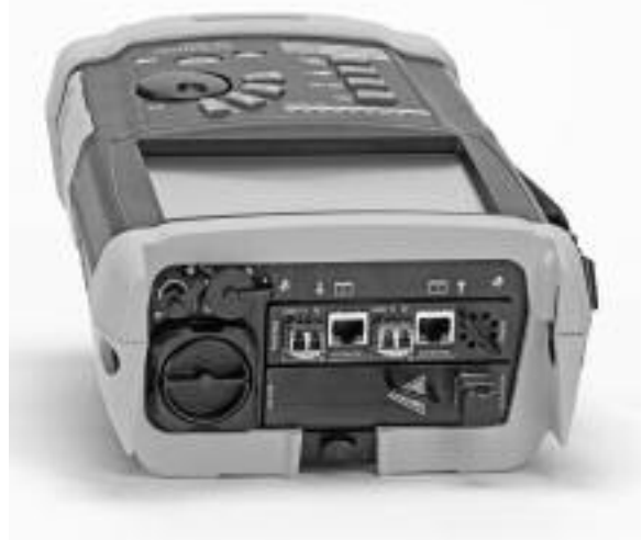
Gigabit Ethernet Module in OV-1000 | Photo TEQ34