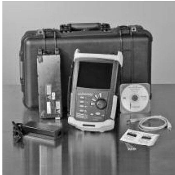
OV-1000 OTDR Kit | Photo LAN730