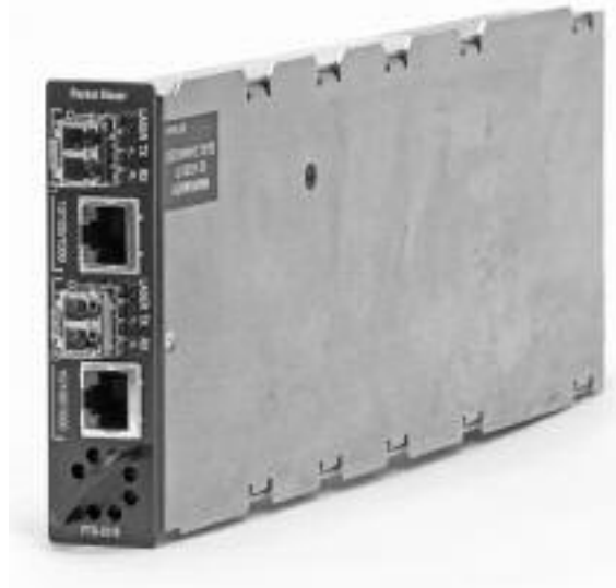
Gigabit Ethernet Module | Photo TEQ33

BERT uses a pseudo-random binary sequence (PRBS) encapsulated into an Ethernet frame, making it possible to go from a frame-based error measurement to a bit-error-rate measurement. This provides the bit-per-bit error count accuracy required for the acceptance testing of physical-medium transport systems. BERT over Ethernet should usually be used when Ethernet is carried transparently over layer-one media.