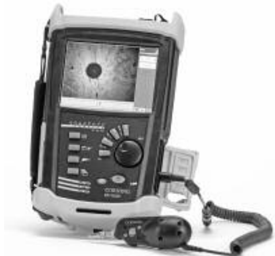
Video Probe Connected to OV-1000 | Photo TEQ35