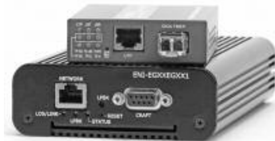
Diverter with Media Converter | Photo TEQ31

This frame analysis feature enables multi-stream traffic generation and analysis allowing for the troubleshooting of Ethernet circuits as well as customer-traffic analysis and error identification. Thanks to its packet jitter-measurement capability (RFC 3393), the Gigabit Testing Module lets service providers efficiently benchmark transport networks when it comes to delay-sensitive traffic such as voice and video over IP.