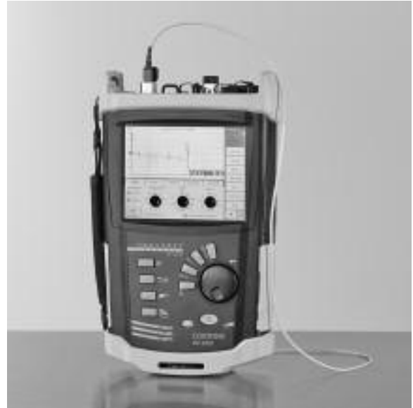
OV-1000 OTDR | Photo LAN731

Along with offering three OTDR test modes — Auto, Advanced and Template Trace — the OV-1000 is future-ready with the ability to accept protocol testing modules, such as Gigabit Ethernet, as they are made available.