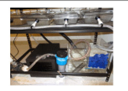
Figure 4: The drainage tubes are carrying contaminated water from the tanks into the wet dry filter complete system. The main mechanisms are the particulate filter, wet dry filter complete system, and chiller.

Assemble the wet dry filter complete system (WD-100CS) per the manufacturer's recommendations. This system will provide two components of the water purification system, charcoal bags and bio balls. The charcoal is one of four components of the water purification system. It will remove certain impurities such as chlorine while ignoring others like nitrates, which will be addressed by other components of the water purification system. The bio balls within this system will provide the surface for the growth of denitrifying bacteria to remove nitrates from the water. Place this system on the right side of the rack, underneath the bottom shelf (Figures 2 and 4). Make sure that the drainage tubes are placed into the charcoal/bio ball compartment of the wet dry filter complete system (WD-100CS).