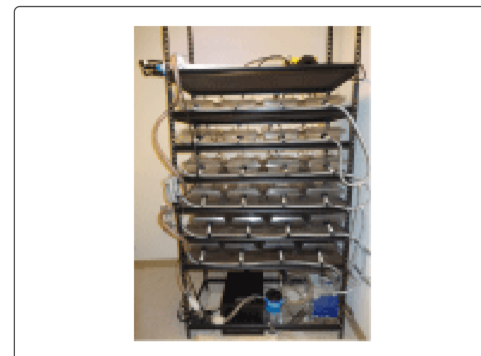
Figure 2: Front view of assembled water system (photo).

Once all twenty four tanks are placed on the assembled rack, the drainage system can be constructed (Figure 2). For the first tank on the left side of each row, cut a 10" piece of \frac{1}{2} " I.D., vinyl reinforced clear tubing (TVR70) and insert it into the tubing adapter tee (62123) in such a way that it curls up the side of the rack's column (Figure 1). This will allow oxygen into the drainage system to help with the water flow. It may help to soak the vinyl tubing in hot water before sliding them over the barbs of the tubing adapter tees (62123). For the interior tanks on each shelf cut 11 inches of \frac{1}{2} " I.D., vinyl reinforced clear tubing (TVR70) to connect to the other tanks tubing adapter tees (62123). Each shelf has its own drainage line; however, the drainage lines for shelves 1 and 2 are coupled together as well as 3 and 4. These two pairs are connected using a \frac{1}{2} " x \frac{1}{2} " x \frac{1}{2} " plastic barb tee (A-381). This was done to increase flow of water into the wet dry filter complete system (WD-100CS).