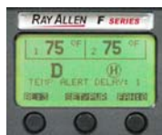
Initial Display – Default Delay 1 Minute

Once the diagnostic is complete, the HUD will show displays similar to this: