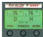
Display After 1 Minute Delay – Ready to Go

After allowing for the 1 minute delay (default), the display will show two independent temperature readings, a bold D (K9 Deploy Ready), a bold H (Heat/Temp Alert Ready) and SYS OK. Along the bottom are BL: (Backlight), SET/PWR (menu access and power on/off), and FAN: 0-OFF, 1-LOW, 2-MED, 3-HIGH).