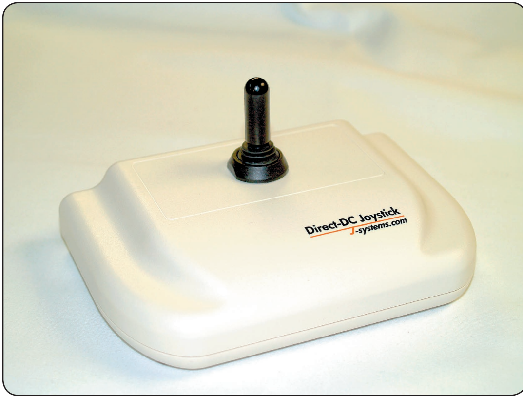
DDC-1 Direct DC Joystick Controller