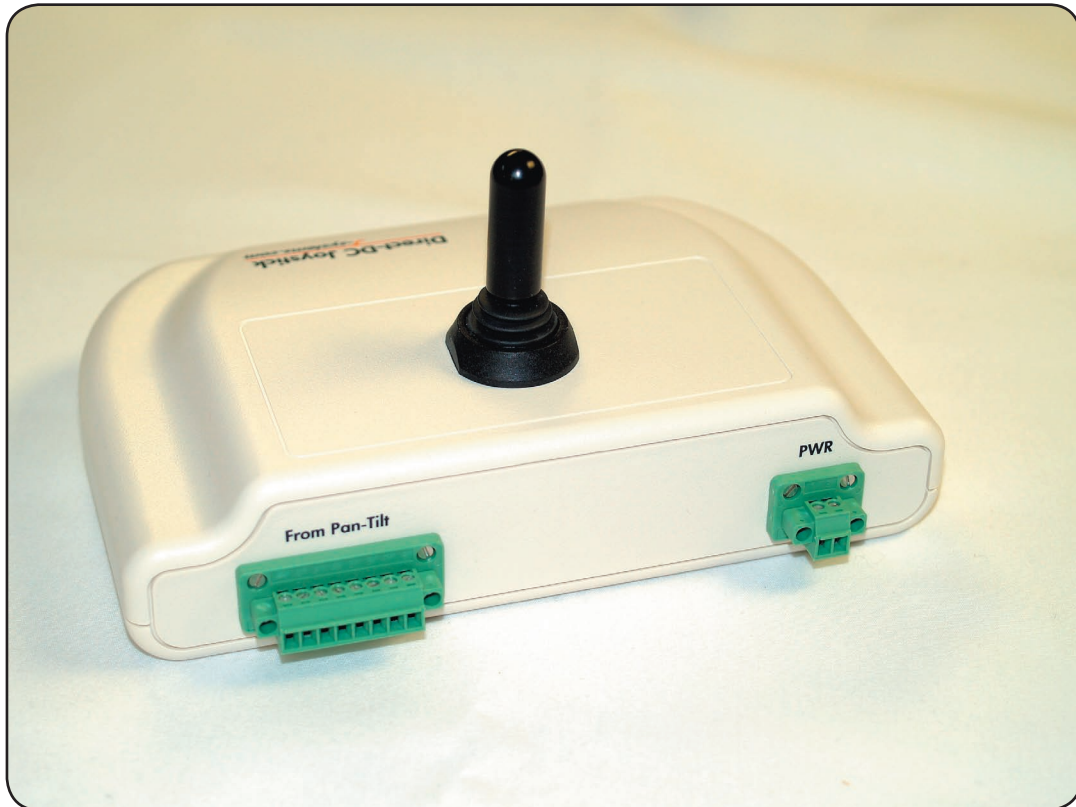
Rear View of DDC-1