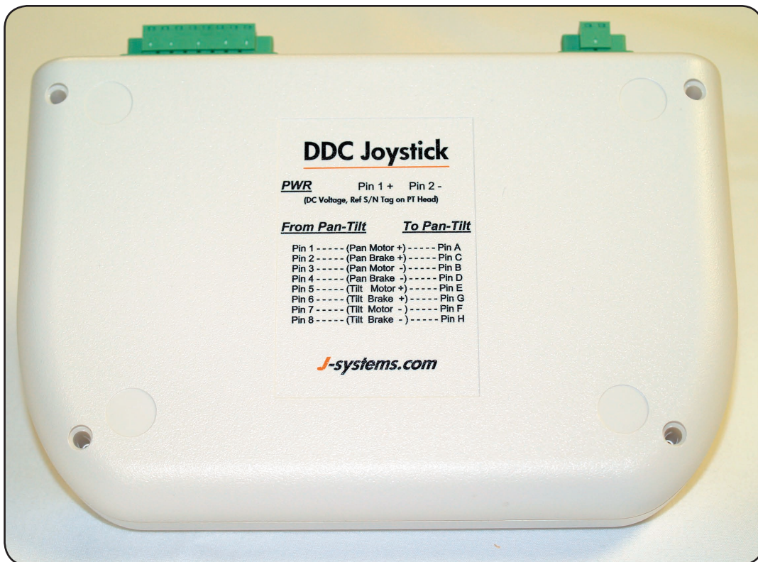
Bottom View of DDC-1 Showing Wiring Chart