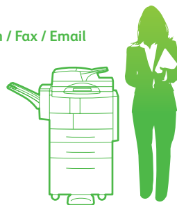
WorkCentre 4260XF with finisher and 2,000-sheet high-capacity feeder