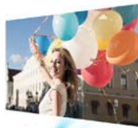
Conventional projectors offer low-quality images