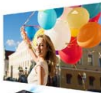
SuperColor™ projectors offer color accuracy levels

ViewSonic's proprietary SuperColor™ Technology offers a wider color range than conventional DLP projectors, ensuring that users enjoy more realistic and accurate colors. With an exclusive color wheel design and dynamic lamp control capabilities, SuperColor™ Technology projects images with reliable and true-to-life color performance, in both bright and dark environments, without sacrificing image quality.