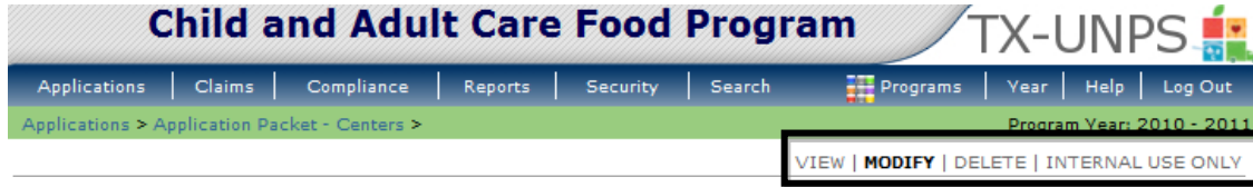
Figure 3: Screen Options - example

Data entry screens in the system offer the user some or all of the following options: VIEW , MODIFY , DELETE , and INTERNAL USE ONLY . The Screen Options area is located on the top right side of the screen, directly beneath the colored bar.