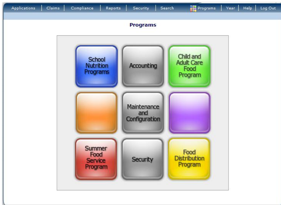
Figure 4: TX-UNPS Programs Page

TIP: The Accounting, Maintenance and Configuration, and Security tiles are always gray because these are administrative modules that are available to only authorized State users. Contracting Entities will not have access to these modules. Only select authorized State users will have access to these modules.