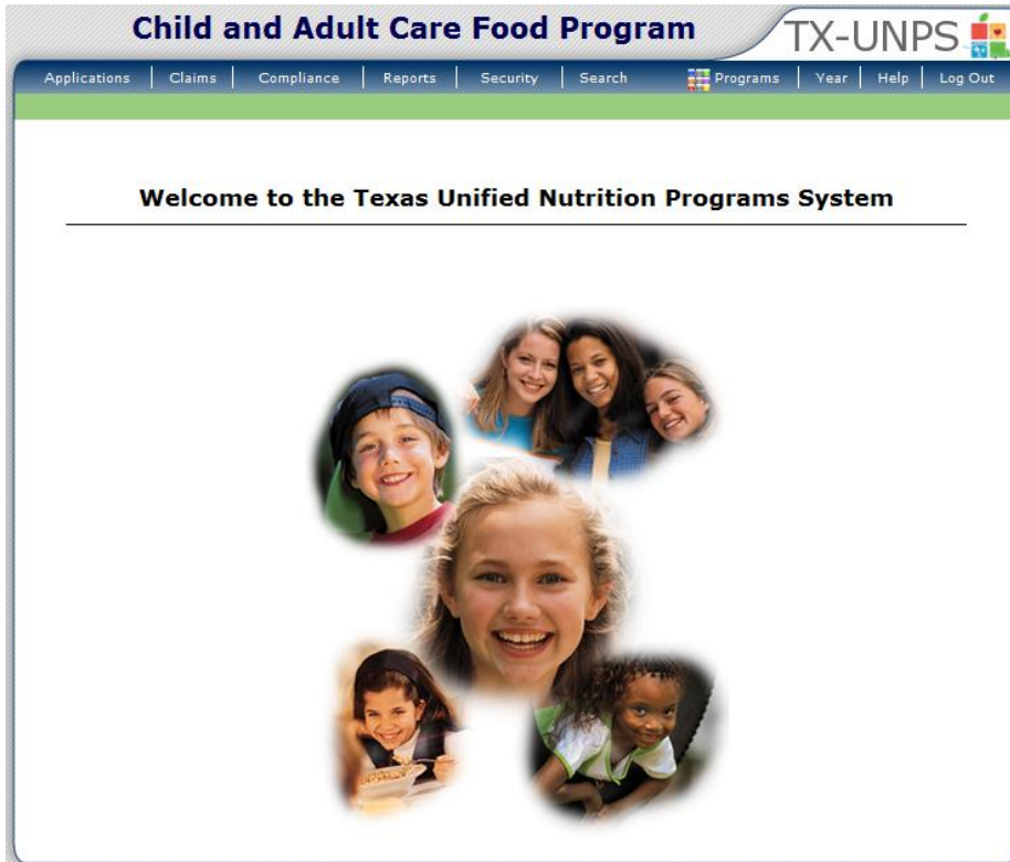
Figure 5: Child and Adult Care Food Program Home Page