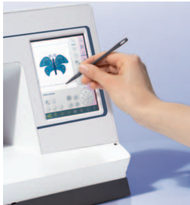
You can easily select the desired function with the ergonomic stylus.

More than one hundred enchanting embroidery designs are included when you purchase the PFAFF® creative™ 4.0 sewing and embroidery machine. These include the butterflies and all motifs shown in this brochure, so you can start embroidering immediately! You will find thousands of embroidery designs at your authorized PFAFF® dealer and at www.myembroideries.com . A wide selection of topics and imaginative techniques are just waiting for you. The collection of embroidery designs is constantly being expanded – a continually growing source of new inspiration.