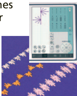
Create your own stitches and discover the possibilities!

Unique and only from PFAFF®! You can also easily edit built-in stitches to add your own personal touch.