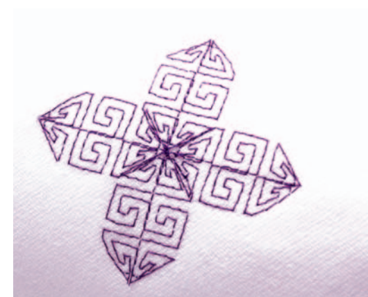
New arrangements and delightful designs are created using Tapering.