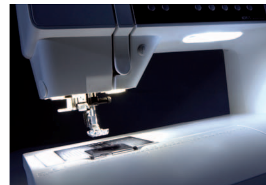
Brilliant – LED lights

Optimized bright lights illuminate the entire sewing area with no shadows.