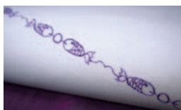
Combine your favourite stitches, mirror them, and sew them in one step.

Alter your favorite stitches, mirror them side-to-side and/or end-to-end, combine them, and change the settings of built-in stitches to your personal liking. Completely new patterns will appear before your eyes. Save your own stitches in the Personal Menu and sew them in one step, repeatedly. Incorporate Program Stop, Thread Snips or Tie-off into a stitch sequence. Your sequence does exactly what you want, every time.