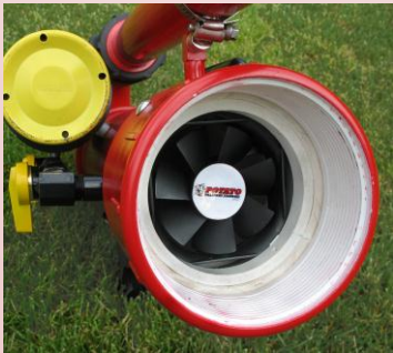
The built in chamber fan really ramps up the power

With the gun's internal chamber fan you can really ramp up the power! Self-contained and battery operated, it stirs the fuel/air mixture during the shot for maximum power. It also allows for the evacuation of the spent gas in the combustion chamber in a matter of seconds so you're ready for the next shot... fast!