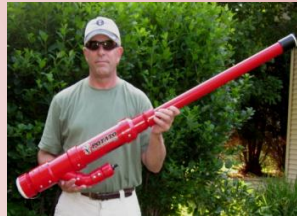
Compact and just 6.5 lbs

The MG-11 is powerful and really easy to use. Just load the potato, fuel with the aerosol propellant for 5-7 seconds, screw on the rear cap and you're ready to fire!