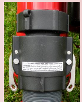
Easy to use quick release barrels

The self contained MAPP gas cylinder coupled with the QuickFuel™ metered fueling system is simple to operate and lets you precisely fuel the gun in under 10 seconds. This means faster shooting with less misfires. The integrated quick release barrel system lets you switch from the breech loading potato barrel to the tennis ball barrel with ease.