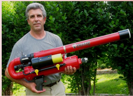
The over/under design of the gun makes the VX-3 Sabre easy to handle