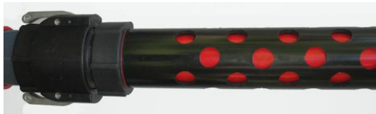
Barrel Cover shown with optional Quick Release