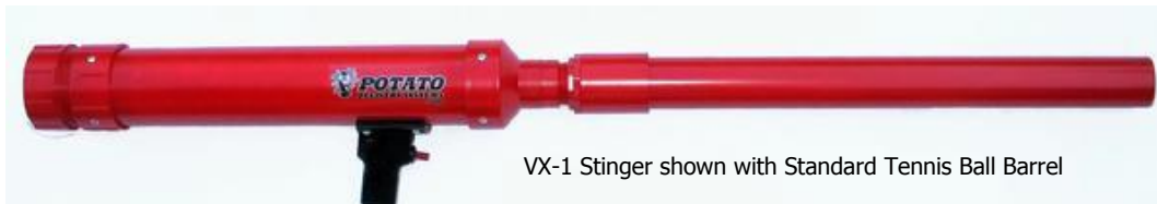
VX-1 Stinger shown with Standard Tennis Ball Barrel