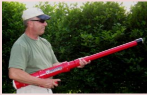
Or Hip Shot