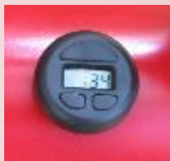
Accurate Fuel Timer