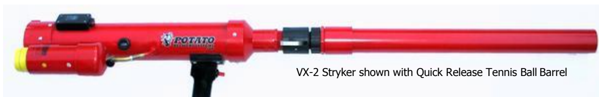
VX-2 Stryker shown with Quick Release Tennis Ball Barrel