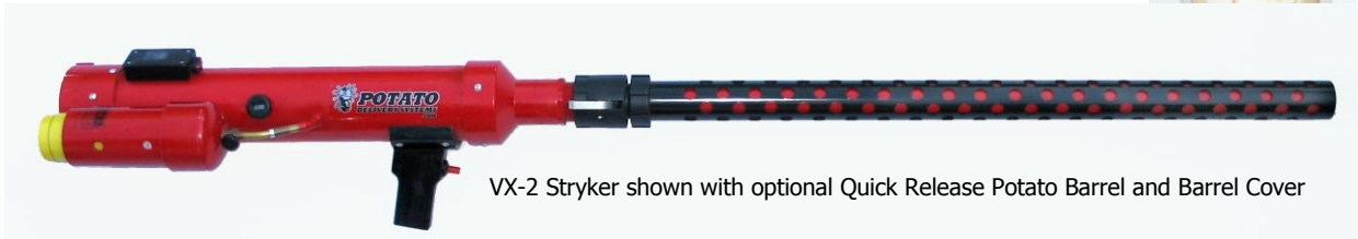
VX-2 Stryker shown with optional Quick Release Potato Barrel and Barrel Cover