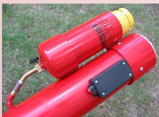
Self Contained Fuel Tank

The VX-2 Stryker potato gun system elevates potato guns to a whole new level. With its self-contained design, this combustion gun is powered by a MAPP gas cylinder that is integrated into the body of the gun for fast and easy fueling. Other features include electronic ignition, interchangeable potato/optional tennis ball barrel and an internal chamber fan for maximum power.