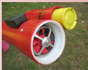
Internal Chamber Fan

The self contained MAPP gas cylinder fuels the gun in 30-40 seconds. There is even a countdown timer for accurately! The internal chamber fan stirs the fuel/air mixture to provide maximum power. It also allows for evacuation of the spent gas in the combustion chamber quickly so you're ready for the next shot... fast! The fan is self-contained and battery operated.