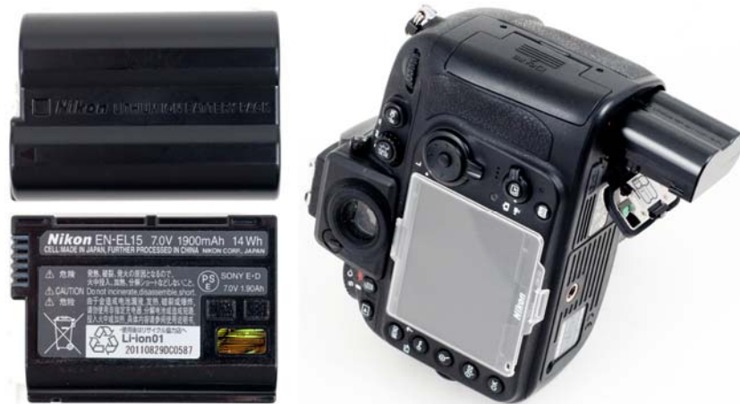
FIGURE 1B – Examining and inserting the battery

If you can hold yourself back from turning on the camera until after the battery is charged, that would be the optimum situation. That'll give you some time to read more of this chapter, and even check out the User's Manual.