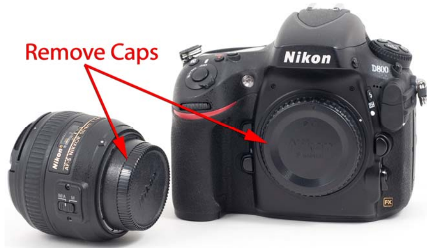
FIGURE 2A – Remove the lens and body caps

One of the powerful things a DSLR like the D800 can do is use a variety of lenses to achieve various subject "looks" or perspectives. If you've never put a lens on a DSLR before today, please read this carefully so that you won't damage the lens or camera body.