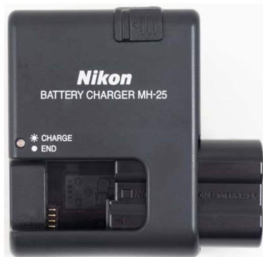
FIGURE 1A – Preparing to charge the camera's battery

When my latest camera arrived, the battery was about 40 percent charged. I used the camera for an hour or two before I charged the battery. However, let me mention one important thing. If you insert the battery and its charge is very low, such as below 25 percent, it might be a good idea to go ahead and charge it before shooting and reviewing lots of pictures. You may be able to set the time and date, and test the camera a time or two, but go no further with a seriously low battery.