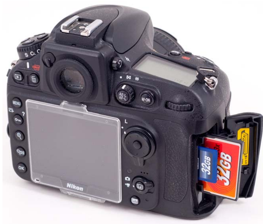
FIGURE 4 – Inserting memory card(s)

To open the Memory card slot cover , you pull the cover toward you until it pops open. If you try to plug in the memory cards backwards or upside down, they will not insert properly. There is only one way the memory cards can be fully inserted, as shown in figure 4.