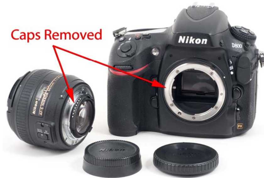
FIGURE 2B – Caps have been removed

Now, let's remove the caps and prepare to attach the lens to the camera.