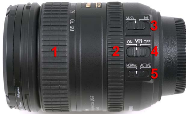
FIGURE 3 – Lens zoom ring, focus ring, and switches

While examining the lens for later use, you'll notice several controls that you'll need to use (see FIGURE 3). Many AF-S Nikkor lenses, and even aftermarket lenses, have similar controls, although the names might vary slightly.