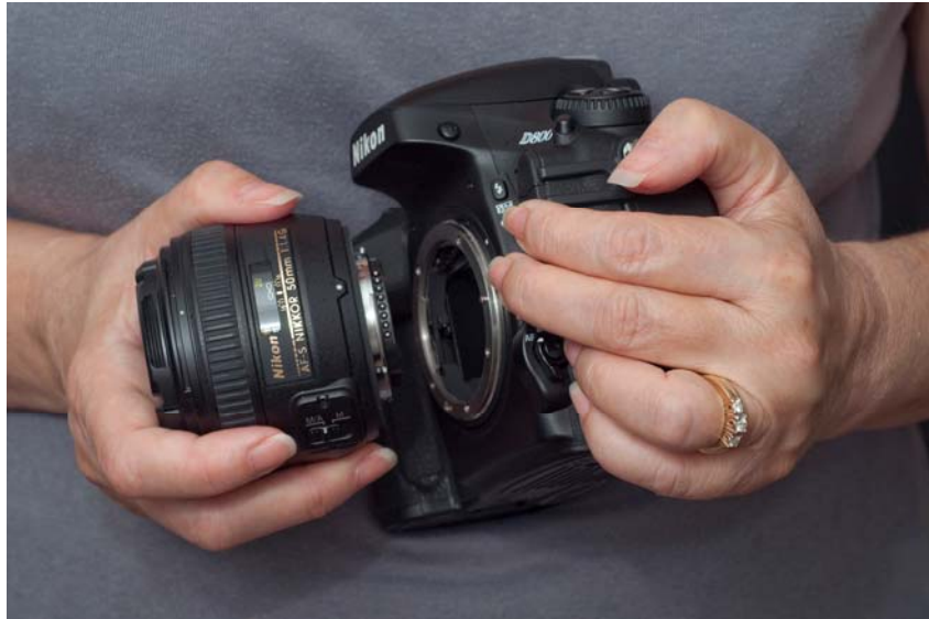
FIGURE 2D – Removing the lens from the camera