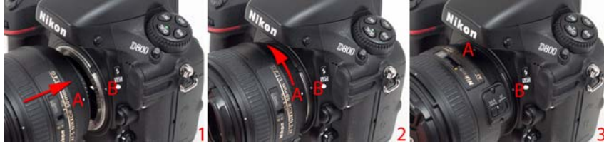
FIGURE 2C – Mounting the lens on the camera step-by-step

You are safe with virtually all Nikkor manual focus AI and AI-S lenses, plus the Nikkor autofocus AF and AF-S lenses. Let's consider how to mount an AF-S Nikkor 16-85mm lens.