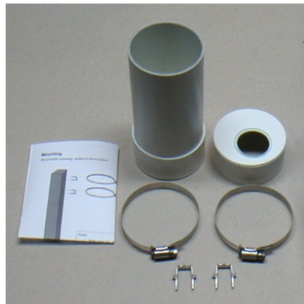
Illustration 3: Housing

http://unihedron.com/projects/sqmhousing/