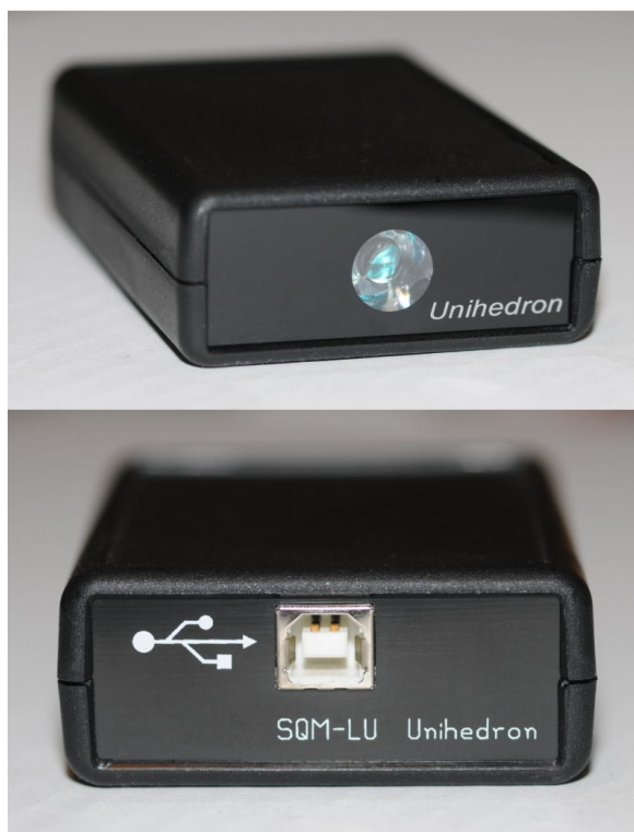
Illustration 2: Front and back of unit