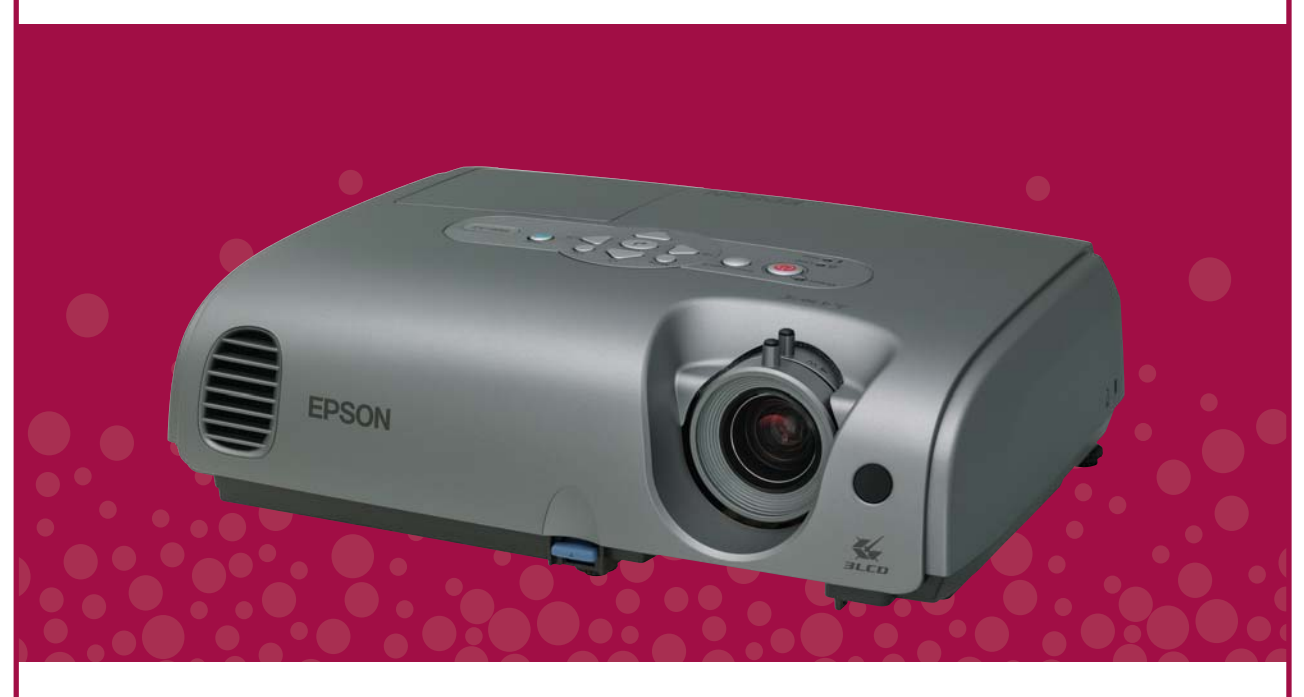
Easy-to-Use Help Function

Most affordable XGA projector without compromising performance and functionality offers the best value ever.