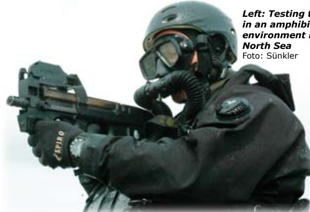
Left: Testing the watch in an amphibious environment in the North Sea

land can hardly be broken and it fulfils its purpose very reliably and without compromise!