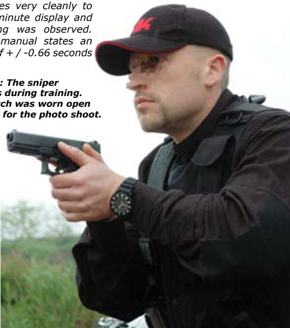
Below: The KHS watch turned out to be a light and tactical companion whose sapphire glass ensures that it need not fear any operation.

per day. This corresponds to a maximum deviation of 40 seconds in two months which is normally adhered to. The watch is a high-quality made watch". A member of the Belgian Special Forces says in conclusion: "Overall a good diving watch, with a stable and lightweight construction. The watch is easy to read on land and under water. Due to the strong luminance of tritium, however, the night vision goggles are easily irritated since they operate on the basis of residual light amplifiers. The situation could be remedied by choosing a strap that has an integrated tactical protection cap". Indeed, KHS TACTICAL WATCHES are currently working exactly on this accessory and a solution to this problem in the series will very soon be made available.