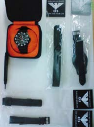
Above: Shipment for extensive field testing. Various tactical and practical change tools and straps round out the package.