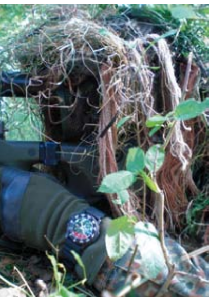
Left & below: The sniper paratroopers during training. The KHS watch was worn open intentionally for the photo shoot.