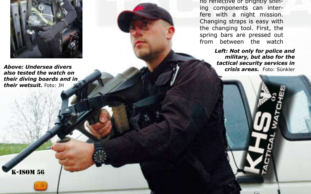
Left: Not only for police and military, but also for the tactical security services in crisis areas.

with regular care. The diver strap, is plastic and very well-made, comfortable to wear and, as indicated by its name, especially suitable for maritime applications. Even if you begin to sweat when the temperature exceeds 40 ° C and there is 90% humidity in summer on the shooting range in the U.S., it does not feel uncomfortable on the skin. However, it could take slightly longer to be able to pull it over the gloves (for diving). After only four months of wear, some natural dirt gathered on the bottom in the grooves of the strap. With a little care, this is again not a major problem. Conclusion: The best available strap from KHS for military and tactical use! Highly recommended. Finally, special mention goes to the fact that KHS TACTICAL WATCHES do not use any silver metallic reflective clasps like most manufacturers of tactical watches do. Rather, all of the straps use non-reflective black coated strap clasps. This reinforces the tactical advantage of the already-mentioned black housing immensely because no reflective or brightly shining components can interfere with a night mission. Changing straps is easy with the changing tool. First, the spring bars are pressed out from between the watch