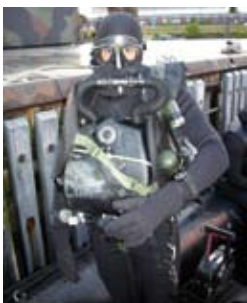
Above: Undersea divers also tested the watch on their diving boards and in their wetsuit.

cal gloves. Conclusion: The NATO strap along with the diver strap are especially recommended. The leather strap with the buckle is very sturdy and seems to be made for civilian life with a tactical watch. It is very comfortable to wear and has a completely black look. However, if you are travelling in hot climates and sweat a lot, it becomes discoloured from below by sweat after a while, but this is natural. The good skin compatibility is an advantage of this strap. The leather strap is also still available in a design with a G-Pad (base or ground pad) which sits between the clock and the skin. This prevents the housing from coming into contact with the skin and this can be especially important for allergy sufferers. The silicone strap with plastic buckle, also completely in black, is also very well made. Even if you sweat or it gets wet, it does not slip on the skin and does not feel uncomfortable. After some time, however, some dirt gathers in the grooves of the underside of the bracelet, but this is no problem