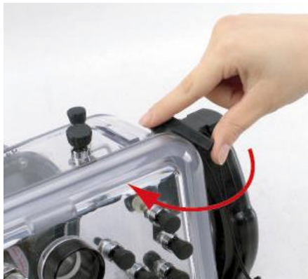
(Fig. 3) Turn to open