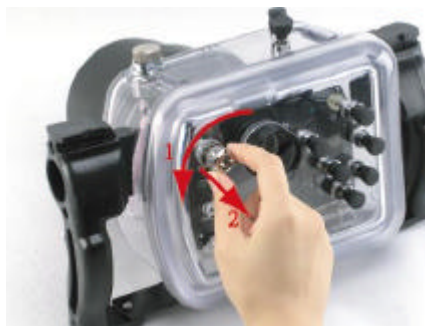
(Fig. 1) Open Housing Procedure

The plug consists of an internal double O-ring seal on the stainless steel slide shaft. These internal O-rings form the watertight seal. There is also a large outer O-ring under the knob. This O-ring serves to prevent contamination of the slide shaft, with dirt, salt etc., and is not required for watertight integrity. If this O-ring should become detached, it can simply be pushed back in place.