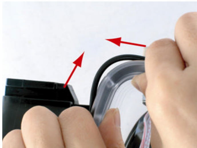
(Fig. 4) Stretch the O-ring