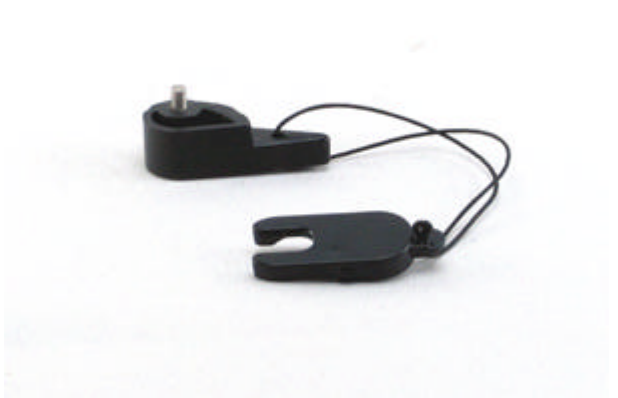
(Fig. 2) Opening lever

After unscrewing and pulling out the pressure release plug, the lid can be opened. To overcome the friction of opening, use lever (Fig. 2) to push against the lid with a cam action. Be sure they are inserted all the way flat to the housing before turning to avoid damaging the protrusions on the lid. The body has four holes on each corner edges for opening. Gently lever off the lid with the supplied opening lever (Fig. 3) taking care not to twist the lid excessively. The lid should be opened keeping it approximately paralleled to the body at all times, turn first one corner a little, then the other a little, and repeat again until the lid is opened. Remember to unscrew and pull out the pressure release plug all the way first, otherwise the air pressure will resist attempts at opening. Lay the lid on a flat stable surface after opening.