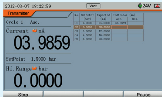
Pressure gauge / transmitter / switch calibration