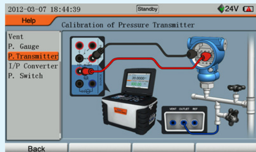
Built-in User's Manual