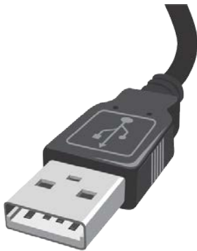
Figure 8: Type A Male USB

Connect the Mini B Male side of the enclosed USB cable to the Skyus.