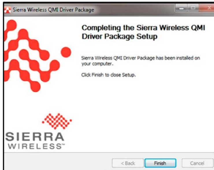
Figure 6: Sierra Wireless Installation Completed

Follow the necessary steps to finish the installation until the screenshot matches the image shown in Figure 6.