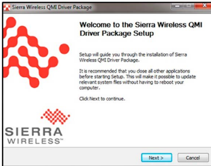
Figure 5: Sierra Wireless Driver Installation

Begin the installation of the Sierra Wireless drivers by clicking on the executable driver installation file.