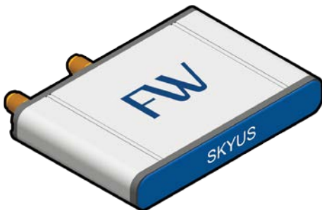
Figure 3: Package Contents: Skyus 4G LTE

If, during inspection of package contents, it is determined that you are missing an item, please contact your FW Service Representative.