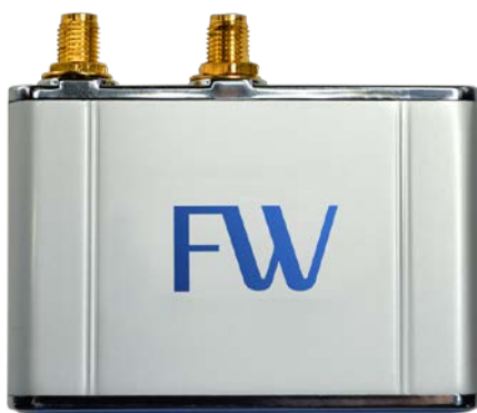
Figure 1: Skyus Top View

The Skyus 4G LTE power consumption is specified as: 500mA at 5VDC typical, 1 A peak.