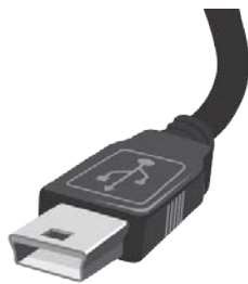
Figure 9: Type Mini B Male USB

Power is provided by the USB cable. Once connected, your Skyus will power up and attempt to register to the carrier.