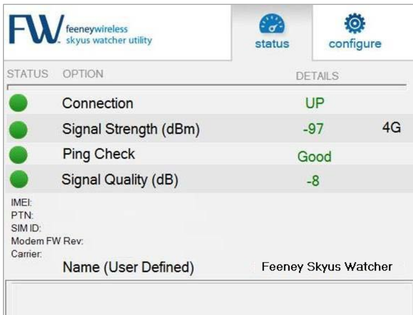
Figure 10: Skyus Watcher

In some installation applications FW can provide a connection management and watchdog utility entitled "Skyus Watcher". The Skyus Watcher utility is designed to provide connection management for the Skyus 4G LTE customers to ensure reliable connectivity in unattended M2M applications.