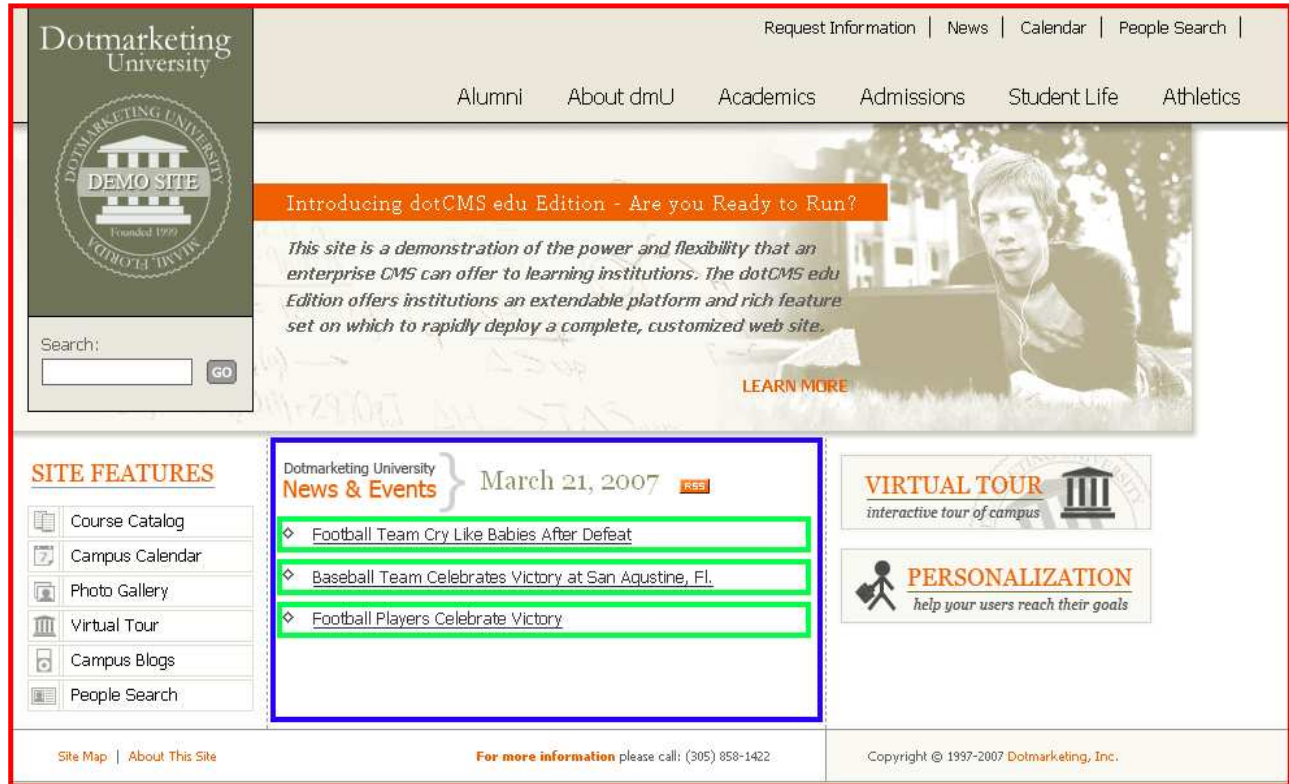
Illustration 1: The red box shows the boundaries of the template. The blue line shows the boundaries of the news listing container and the green boxes show the boundaries of the code part of the container that loops the contentlet that we add to the container.

For the first part of this tutorial, we are going to create the news listing on the homepage. If we look at the design of the homepage, the container for the News Items will be a part of the page that has a container. There are other containers on this page, but for the sake of this