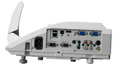
Left Side Profile