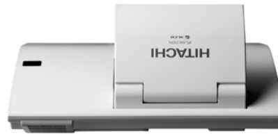
Front 3/4 View

the specific interactive needs of both corporate and education users, the CP-AW2519N is easy to install, easy to use, and easy on the environment. Plus, Perfect Fit 2 enables the user to adjust individual corners and sides independent of one another as well as correcting geometric and complicated distortions, allowing the projected image to fit correctly to the screen quickly and easily.