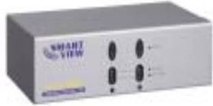
(VRM-712E, ej lagervara)