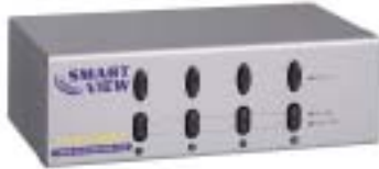
(VRM-714E, art.nr. 25-0060)