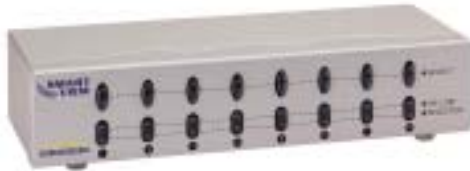
(VRM-718E, ej lagervara)