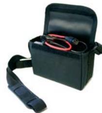
Travel-Pak Battery Booster BW-7635