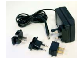
12V Universal 2A Charger BW-1227