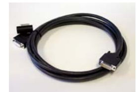
Flash Head Connector Lead BW-7632

Visit www.bowens.co.uk for the widest range of photographic lighting accessories