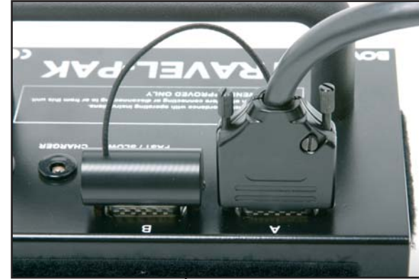
Single Esprit Gemini Connection

A single Esprit Gemini unit can be fitted to either channel A or B with the Travel-Pak cable. Please ensure that the dummy socket is fitted to the unused socket.