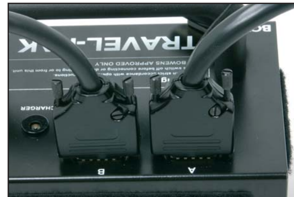
Dual Esprit Gemini Connection

Two Esprit Gemini units can be fitted to the A and B sockets with the Travel-Pak cable. In this set-up the dummy sockets are not used.