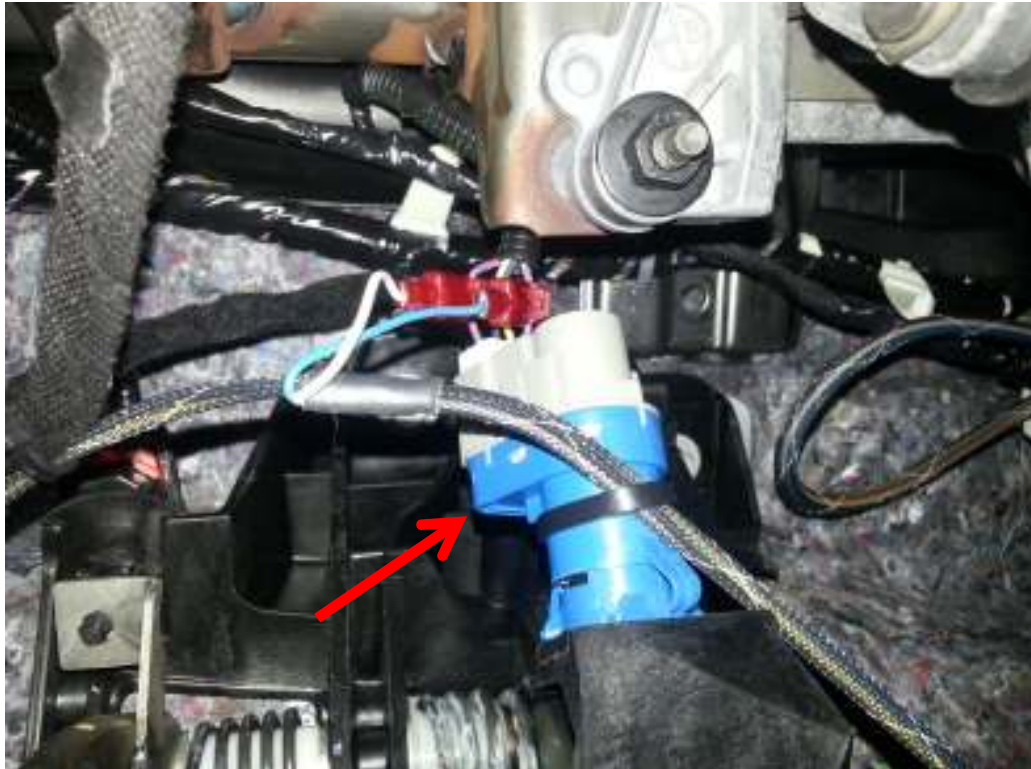
Figure 2 (Brake Sensor)