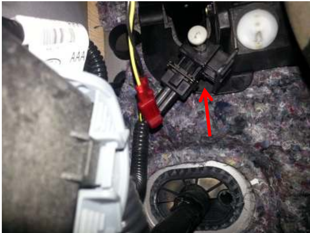
Figure 1 (Clutch Interlock Sensor)

In order for your AUTO-BLiP unit to function properly, you must first perform the calibration sequence outlined in the CALIBRATING UNIT section!!!