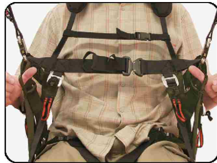
Adjusting of shoulder straps