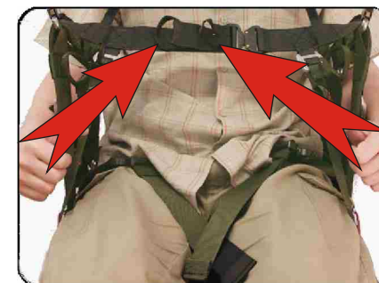
Adjusting of chest strap