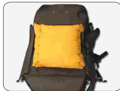
Assembly in outer container