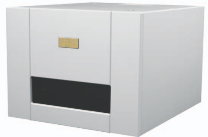
TELOS 600 Universal Power Amplifier

The installation instructions must be carried out in full and the mentioned precautions taken to get the expected result and to avoid impairing the amplifier's performance.