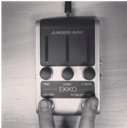
Set pedal in update mode