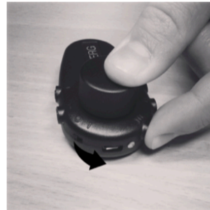
Set AERO in update mode

For more information, please visit: www.aalbergaudio.com/support