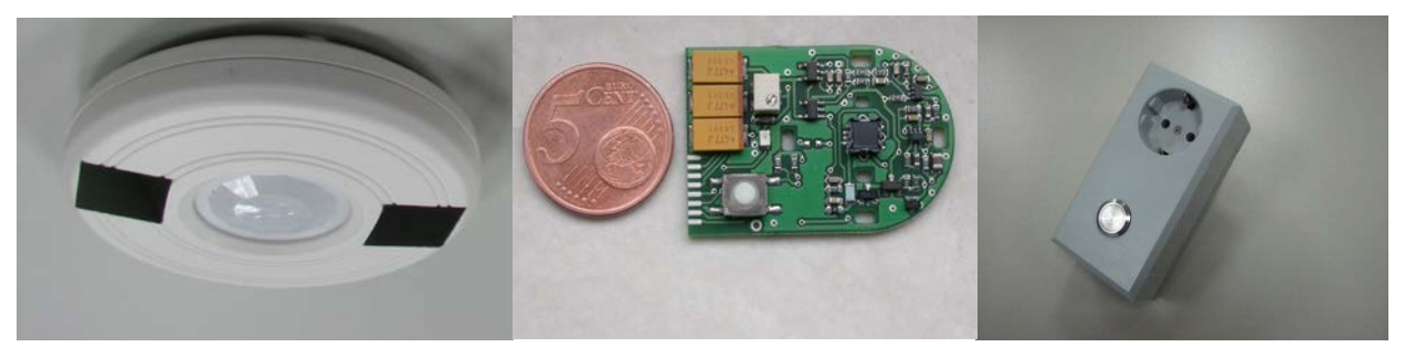
Fig. 1: Ambient light powered Motion Sensor