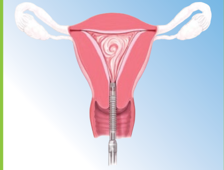
Figure 3: Postprocedure, uterus being cooled with room temperature saline.