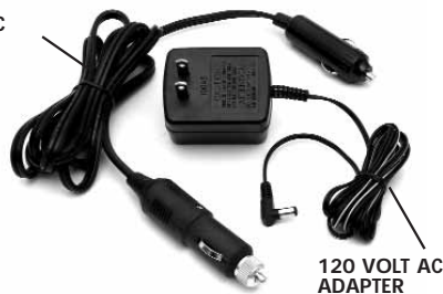
120 VOLT AC ADAPTER