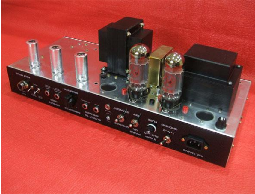
50W Overtone Special