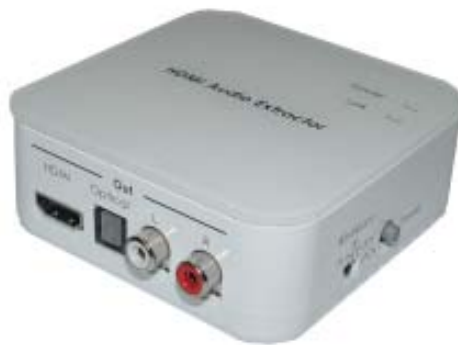
Figure 2-1 LB-HDMI/DE optional stand-alone box enclosure.

For the LB-HDMI/DE, besides the chassis mount version, it does come in a white plastic stand-alone box enclosure. The connectors, switches and functions are all the same but it does come with its own 5VDC power supply. All other functionality is as described in Sections 1.0 and 2.0 of this manual are identical. Figure 2 below shows the Stand-alone box enclosure.