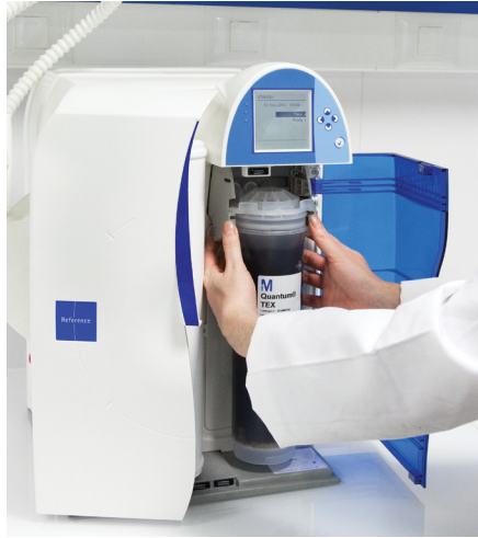
Quantum® Polishing Cartridge