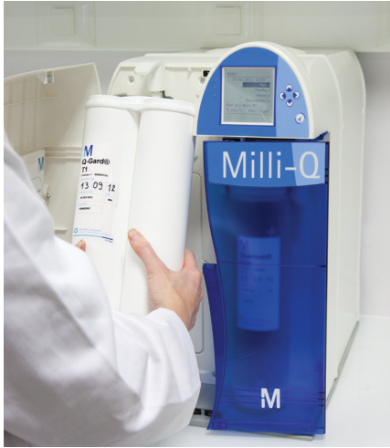
Q-Gard® Pretreatment Pack

Maintaining the Milli-Q® Reference system won't take time away from your research. Maintenance frequency is minimal, and the procedures are simplified to the utmost.