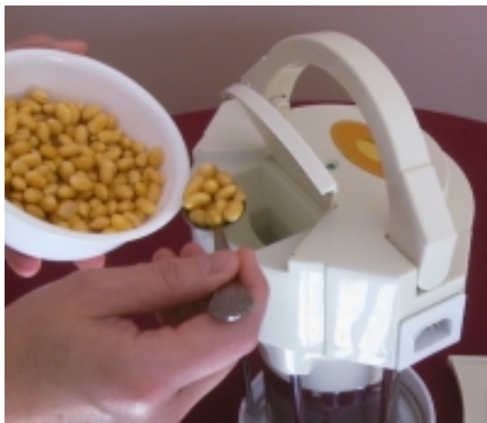
Add soaked soybean with a spoon