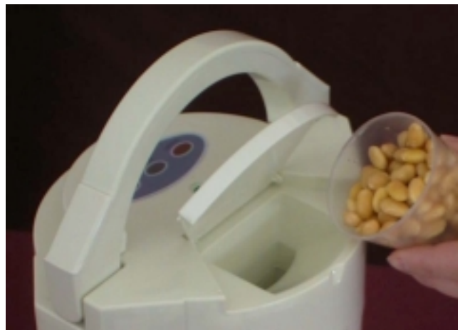
Or with the cup comes with the SoyaPower