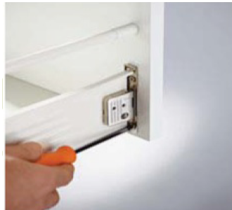
Side adjustment \pm 1.5 mm