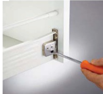
Height adjustment \pm 1.8 mm