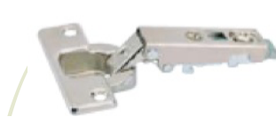
Depth adjustment \pm 2.0 mm