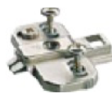
Height adjustment \pm 2.0 mm