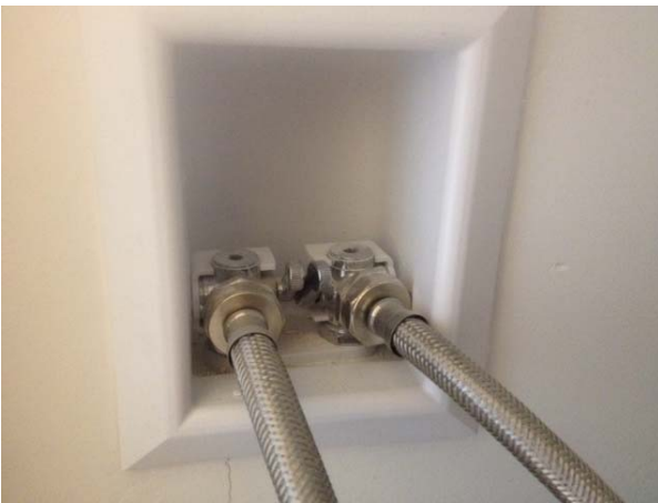
Water Shut-Off Valve

The water shut-off valve is located in the laundry closet and should be turned off after each use to prevent leakage, flooding and other water damage. Any damage to property, personal and secondary items incurred as a result of improper use is the responsibility of the Homeowner or tenant. Push the lever to the "on" position before using the washing machine. To shut the water off, push the lever to the "off" position. In cases where the suite will remain vacant for a long period of time, turn the valve on and off at least three times annually to avoid seizing of the valve.