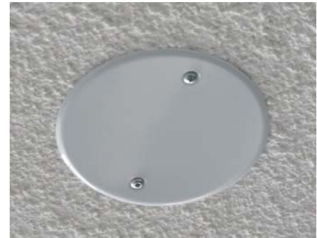
Ceiling Electrical Box

Your dining room ceiling has an embedded electrical box covered by a metal plate. The electrical box is prewired to be controlled by a light switch for future installation and operation of a lighting fixture. The installation of a light should be performed by a qualified electrician. Failure to do so may invalidate the Statutory Warranty on the electrical in your suite.