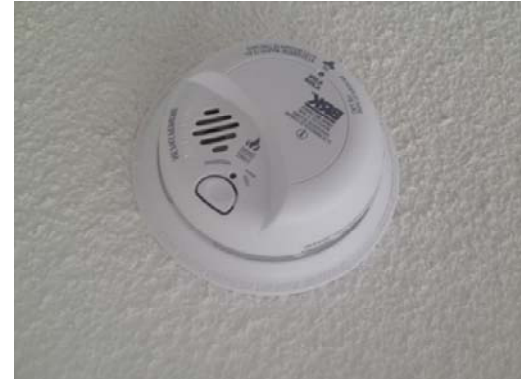
Smoke and Carbon Monoxide Detector

Each suite has a combination smoke and carbon monoxide detector as per Ontario Building Code. It is the Homeowner's responsibility to ensure that the device is operational at all times. The detector is connected to the central power for the building. In the event of a power outage, the detector has a back up battery. It is the homeowner's responsibility to replace the battery.