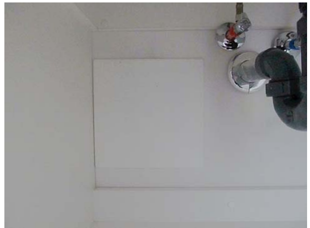
View of interior of cabinet under sink. Water shut-off valve cover plate is seen in left corner.

All toilets are installed with a rubber gasket at the floor flange, which seals the toilet bowl and drain pipe. Infrequent flushing will allow the water to evaporate in the toilet bowl. As a result, the rubber gasket may dry out and