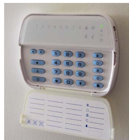
Fitch Security Panel

An operation manual was provided in your key package given to you on your Interim Closing Date.