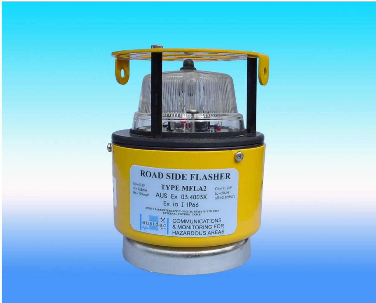
Photograph 1. The basic Roadside Flasher type MFLA2

The unit may also be provided with an attached control lead, see photograph 2, to allow the Road Side Flasher to be controlled by a set of voltage free switching contacts such as those on a pressure or level switch. This control allows the MFLA2 to be used in 'non-powered' alarm and warning annunciation applications throughout an underground mine.