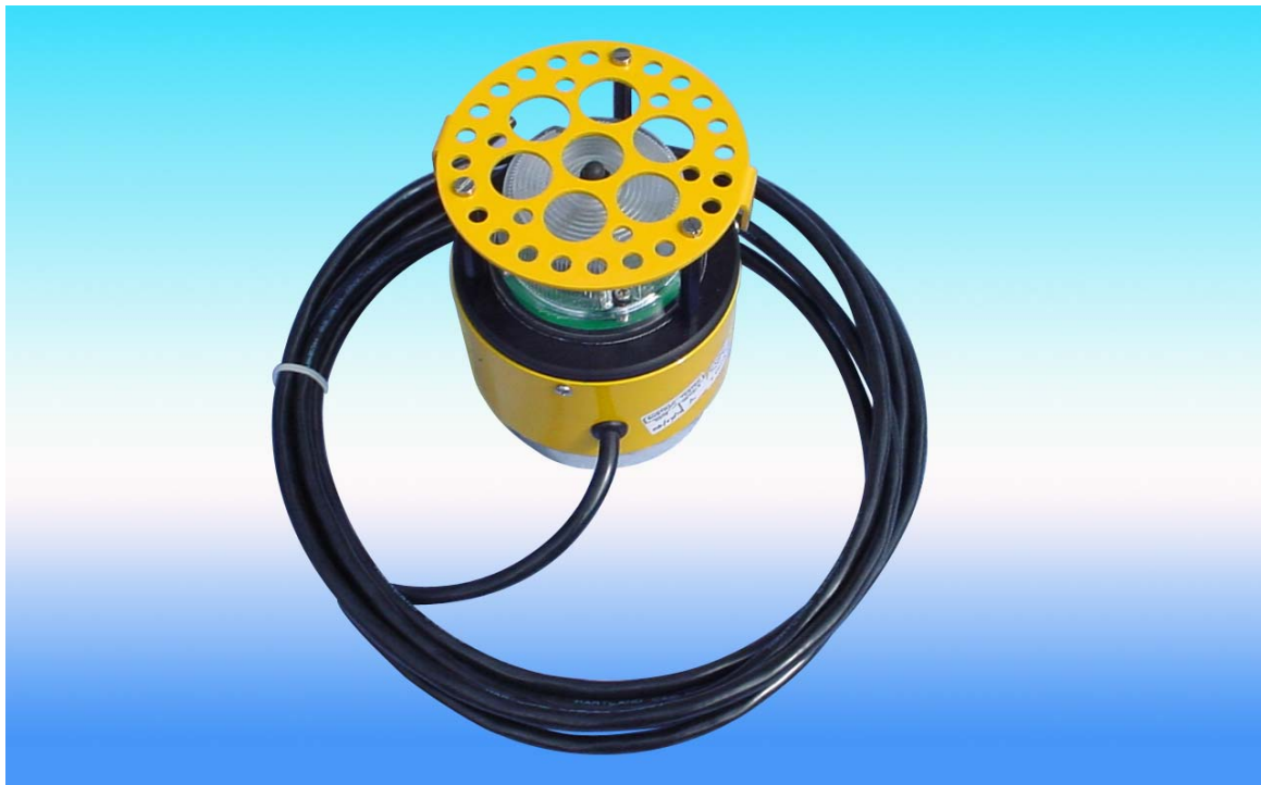
Photograph 2. MFLA2-EC-XX with attached 3m control lead.

The installation of the MFLA2-EC-XX is also straightforward, the Roadside Flasher is fixed in place and the external control lead routed to the control equipment and terminated. The external control lead should be routed and terminated in accordance with the AS2381.7 and AUS Ex 03.4003X. The installation should be tested for functionality to ensure that the lens mounted push-on / push-off switch is in the on position.