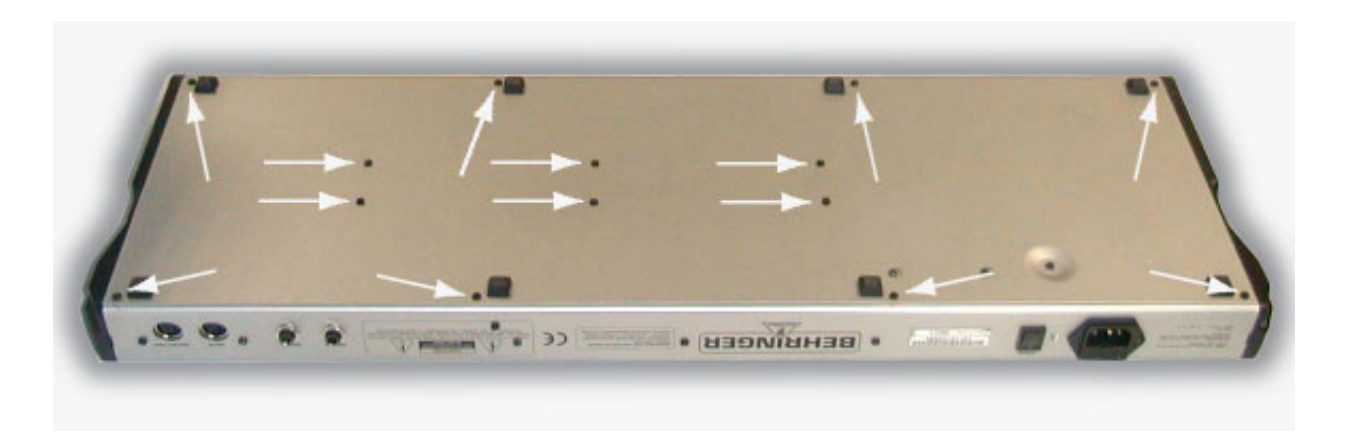
Fig. 3.1: Removing the bottom panel

Place your FCB1010 on a solid, flat base. Turn the FCB1010 around so you are looking at its reverse side. Please make sure that you view the rear panel of your FCB1010 (featuring all connectors). Undo all (14) screws on the reverse side of the device (see fig. 3.1). You can now open the FCB1010's housing by lifting the bottom panel before moving it into your direction. Please note that top and rear panel remain connected by the ground cable. However, there is no need to remove the cable which links the two panels.