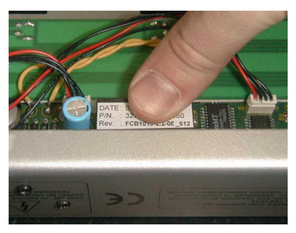
Fig. 3.3: Placing the new EPROM

The new EPROM is placed in the same position on the PCB on the specially designated "track". There is a notch on one side of the EPROM: this notch must be aligned with the notch on the EPROM track! When you press the new EPROM into position, be careful not to press too hard, otherwise the PCB could become deformed or even break! It is not necessary to glue the new EPROM into position!