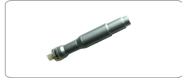
Vacuum SPA Handle