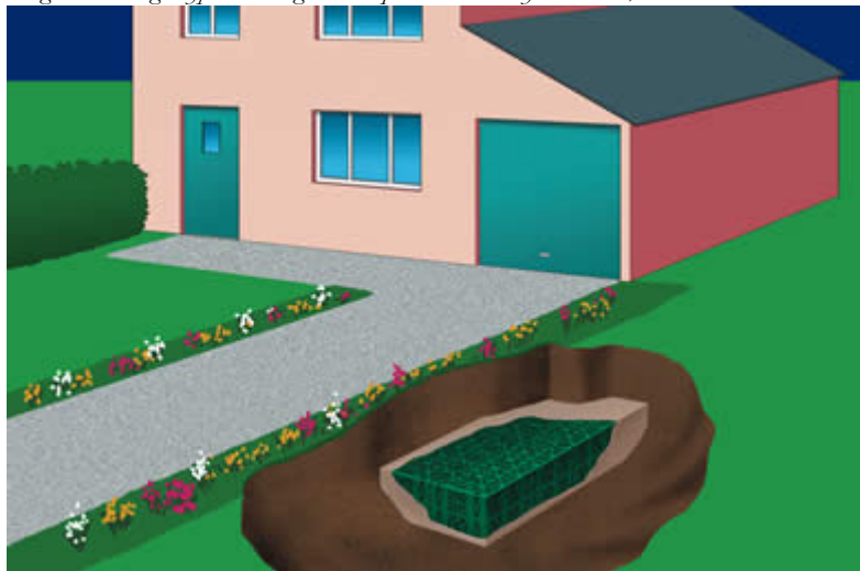
Diagram showing a typical underground 'aquacell' soakaway to a house;

its way from your gutters into the underground pipework. A recommended interval between inspections of 3 months is suggested for visual inspection, with extra attention recommended during periods of heavy rainfall or other adverse weather conditions. Failure to carry this out may result in the soakaway or storage units filling up with silt or debris and becoming blocked, causing rainwater to back up in the drains with risk of flooding. Where your soakaway is located under garden ground you should avoid planting deep rooted trees or shrubs over or near it – the roots can damage the soakaway reducing its effectiveness.