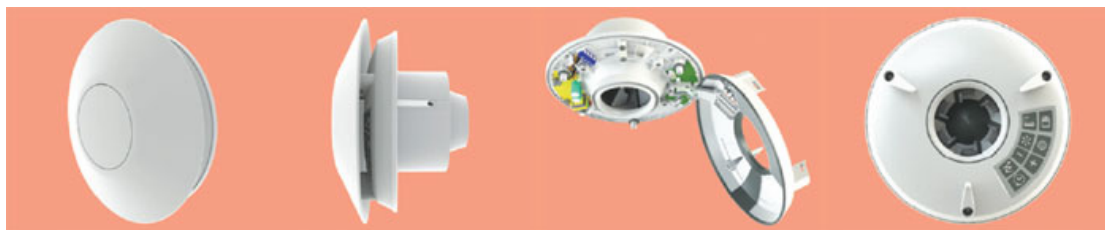
Example pictures of the Greenwood Airvac CV2GIP fan

with GIP (Guaranteed Installed Performance). The fans run continuously at a low (extremely quiet) speed and are automatically 'boosted' to a higher speed when required (the fans boost automatically using their humidity sensor). It is essential that the fans remain in operation at all times (unless switched off for maintenance) to maintain good air quality.